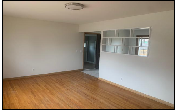
LR - Hardwood Floor