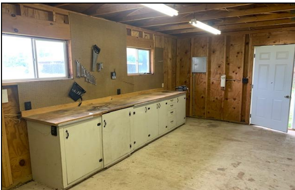
Pegboard Workbench & Vice