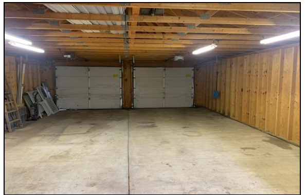
Big Roomy Garage - 2 automatic garage doors