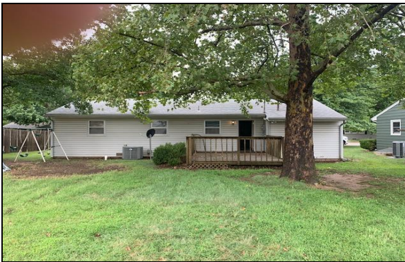
Big Tree w/ Shaded Deck