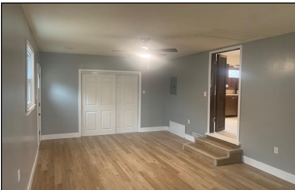
Family Room - New Flooring