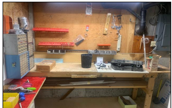
Lower Level Workshop