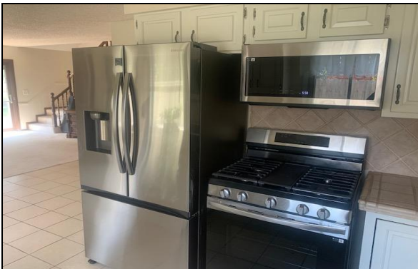
New Kitchen Appliances