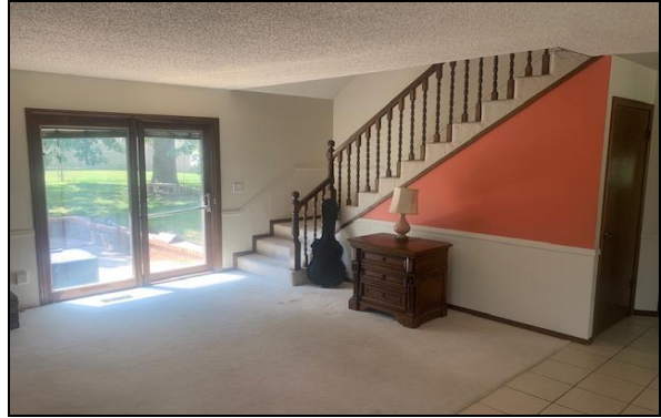
Great Room Staircase