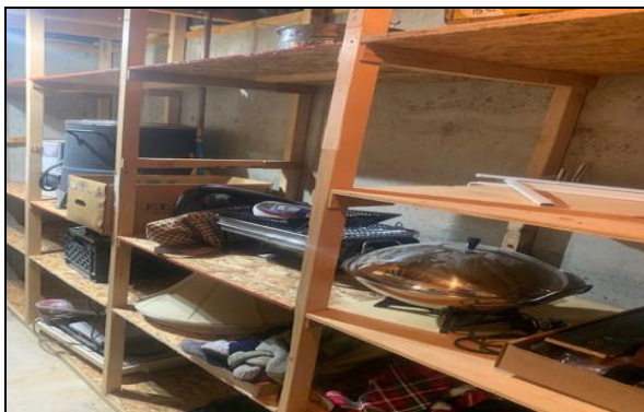
Lower Level Storage