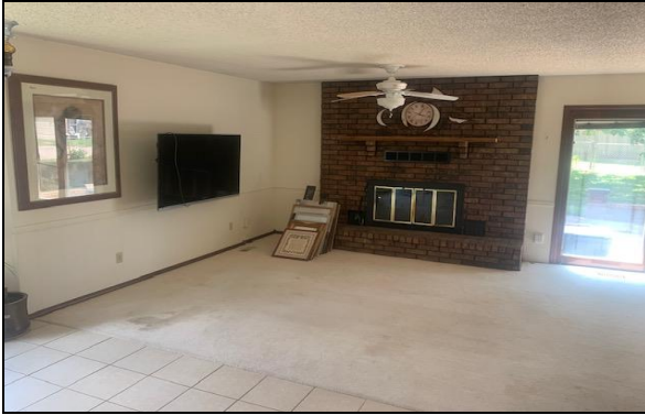
Great Room Fireplace