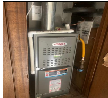
New Central Heat & Air