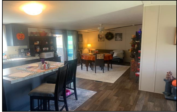
Kitchen Island & Den