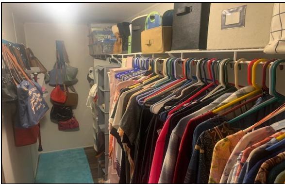
Master Walk-in Closet